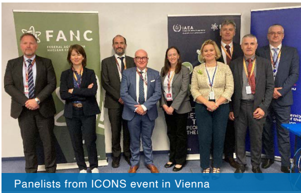
Panelists from ICONS event in Vienna