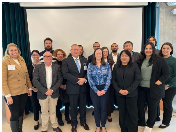
The Advancing INFCIRC/908 Steering Committee and Planning Team Met in Brussels, Belgium, November 2024