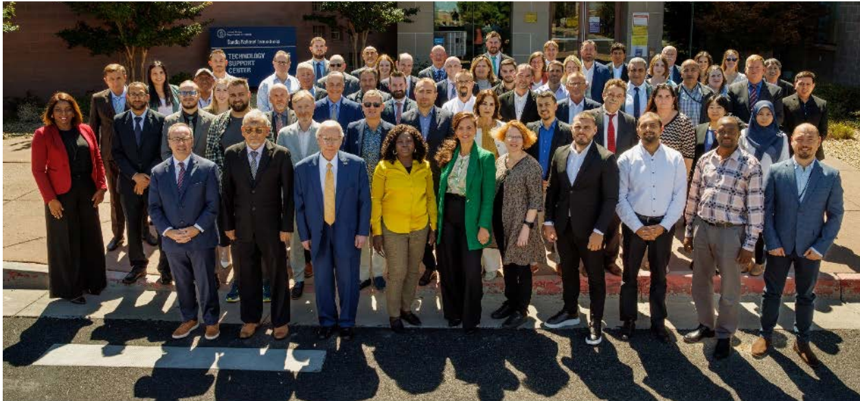
INFCIRC/908 International Practitioner Workshop for Mitigating Insider Threats at Nuclear & Radiological Facilities September 18-22, 2023 Sandia National Laboratories, Albuquerque, NM, USA

In September 2023, 36 practitioners and assessors from 21 countries traveled to Sandia National Laboratories (SNL) in Albuquerque, New Mexico, United States, for a 5-day workshop on advanced Insider Threat Mitigation topics. Each day featured a key theme: pre-employment vetting and trustworthiness determination, continued reliability of trustworthiness determinations, physical protection and technical measures, cybersecurity, program sustainability, INFCIRC/908 Focus Groups, and academia.