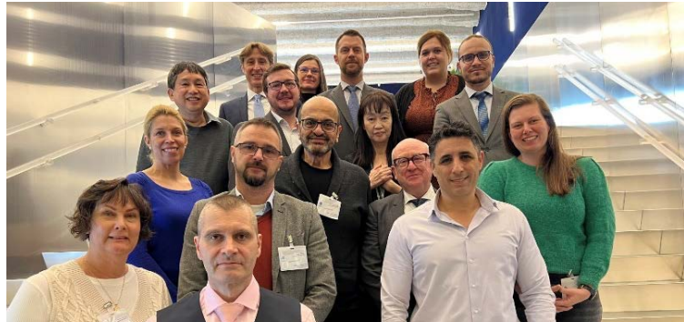
The Advancing INFCIRC/908 International Working Group Steering Committee members and planning team met in Brussels, Belgium, March 2023

In March 2023, FANC hosted the first in-person Advancing INFCIRC/908 International Working Group (IWG) Steering Committee Meeting in Brussels, Belgium. This was the first time the IWG Steering Committee members met face-to-face since the founding of the IWG in 2020. All previous meetings were held virtually due to the COVID-19 pandemic. Attendees included members of the U.S.-Belgium planning team, the IWG Co-Chairs, and Steering Committee members from Canada, Finland, Hungary, Israel, Japan, Jordan, and Morocco. During the meeting, IWG members discussed the status of focus group activities, identified new opportunities for collaboration, and began initial planning and preparation for the 2nd International Symposium on Insider Threat Mitigation.